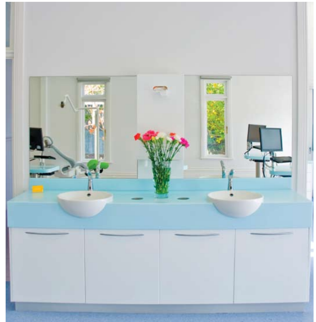
left to right Patient refresh area at Maidstone Patient refresh area at Reservoir Patient refresh waste chute feature at Balwyn Patient refresh area at Geelong