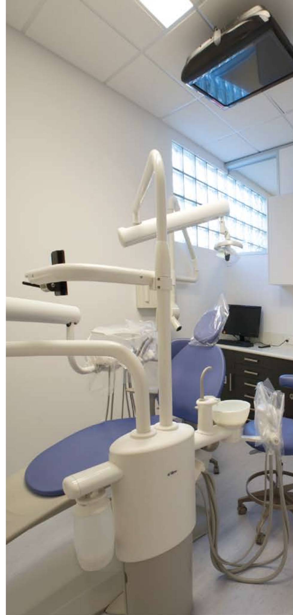
left to right Panoramic view of surgery at Reservoir Surgery at Brighton