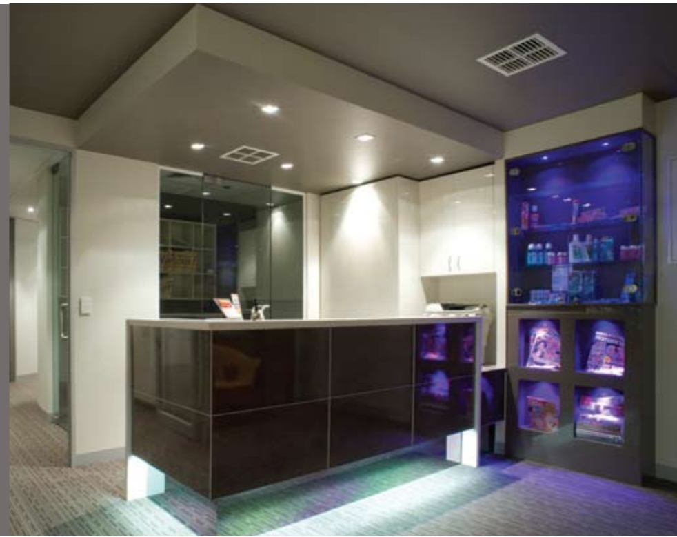
left to right