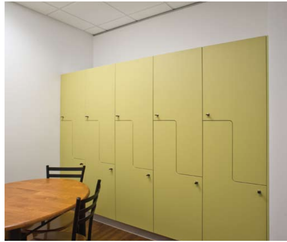
bottom left to right Panoramic view of staff area at South Caulfield Staff relaxation lounge at Reservoir top right Lockers at Brighton

THIS IS WHERE YOUR STAFF CAN RELAX, CATCH UP ON THE NEWS, OR SIMPLY GRAB A COFFEE