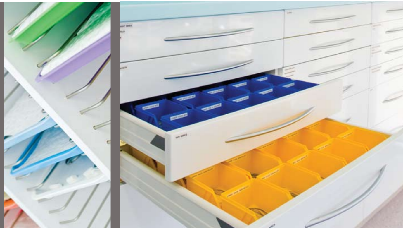
bottom left Panoramic view of sterilisation area at Reservoir bottom right Sterilisation area Balwyn top right Orthodontic Sterilisation area at Geelong

WORKFLOW, FUNCTION, HYGIENE, ERGONOMICS, STORAGE... THESE ARE ALL CRITICAL ASPECTS OF YOUR STERILISATION AREA